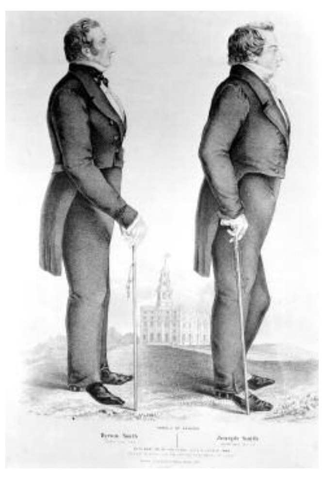
Hyrum and Joseph Smith

up the local citizenry.<sup>21</sup> Hyrum Smith noted that the men who guarded them during the night were the same men who had sat as jurors during the day.<sup>22</sup> However. guards' all-night partying drinking caused a number to be incoherent when the court was in session. At times, some jurors were so drunk they were lifeless and had to be carried out of the room.<sup>23</sup> Because no formal records of the actual court testimony known to exist, what transpired during the pro-