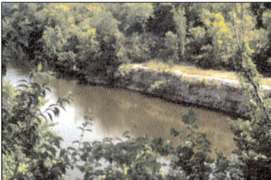
Temple Quarry at Nauvoo.