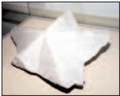
Star stone from temple displayed in the Seventies Hall, Nauvoo.