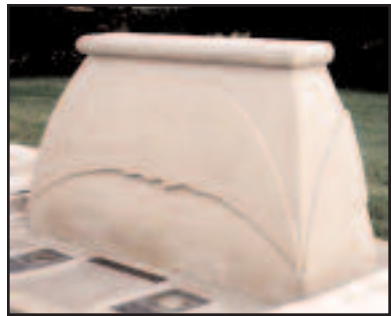
Sun stone from temple (top) and moon stone (bottom) displayed near temple site in 1994.