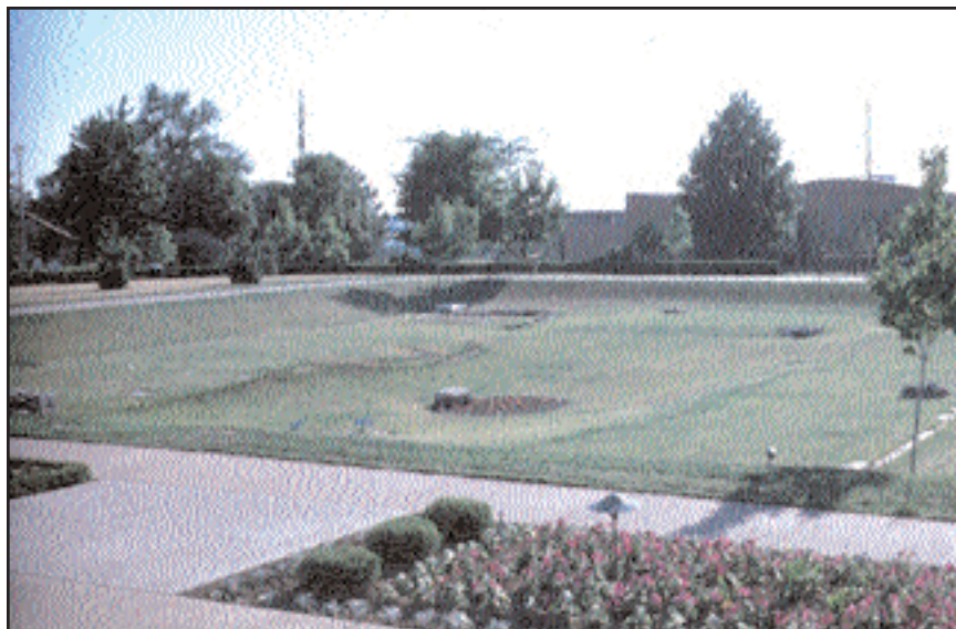
Temple site prior to groundbreaking ceremonies for the reconstruction.