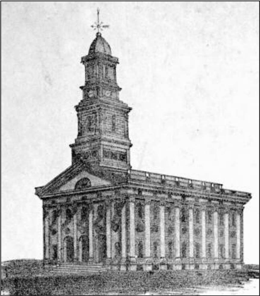
First known drawing of the Nauvoo Temple by Architect William Weeks. This map appears on Gustave Hill's "Map of the City of Nauvoo."

During July 1844, the Saints again committed themselves to completing the sacred building. By December 1844, the thirty pilasters (columns) on the exterior of the temple were almost complete. Each pilaster contained a moon stone and a sun stone. Star stones were put above each pilaster. On 6 December 1844, the final sun stone was raised up to be put in place. While the workers were