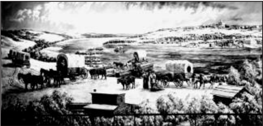
Crossing the Mississippi.

Elder Woodruff concluded the meeting by testifying of the truthfulness of Elder Hyde's words. "The Saints had labored faithfully and finished the temple and were now received as a Church with our dead. This is glory enough for building the temple and thousands of the Saints have received their endowment in it. And the light will not go out." 21