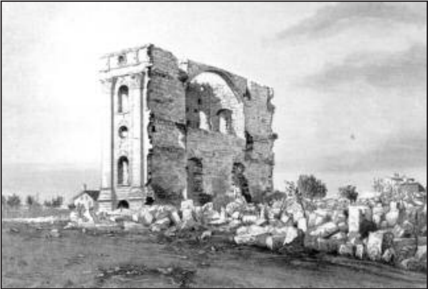
Ruin of the Temple at Nauvoo, by Frederick Piercy, Route from Liverpool.

The last remaining vestage of what the famous Mormon temple was in its former glory has disappeared, and nothing now remains to mark its site but heaps of broken stone and rubbish. . . . The shrine of the pilgrimage of thousands who have annually flocked to gaze in wonder and awe upon the beautiful ruin,—is no more. The eye of the stranger and traveller who approach the classic city of Nauvoo will no more rest upon the towering ruin. . . . One day last week a mine was placed beneath the remaining portion yet standing; and with the blast that followed the last of the famous Mormon temple lay prone and broken in the dust. 46