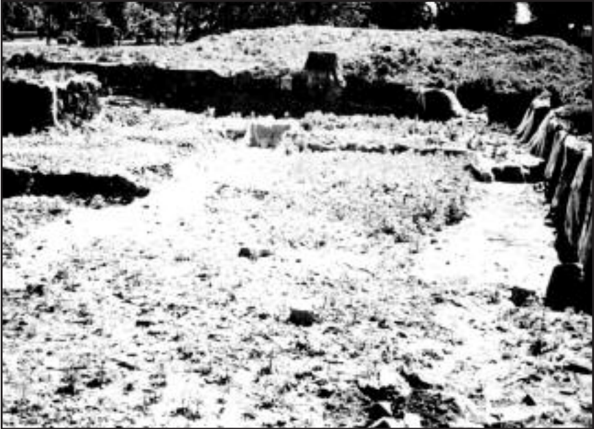
Excavation of Nauvoo Temple foundation, 1962.

Other artifacts were later found, including part of the bricked basement floor, workmen's tools, glass, nails, bolts, hinges, and other items. Also in 1962, the Church formed a nonprofit corporation named "Nauvoo Restoration, Inc.," which was founded to oversee restoration of many historic buildings in Nauvoo.