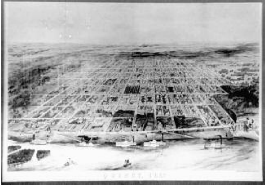
Quincy Lithograph 1859