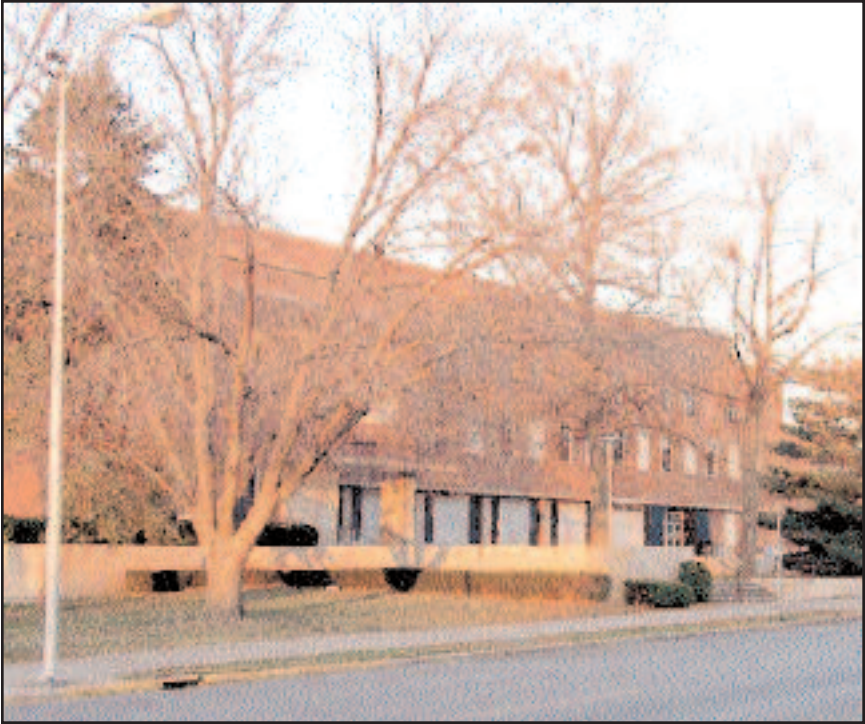
Adams County Court House, located on Jefferson Square, Vermont Street between 500 and 600 Streets, Quincy, Illinois.